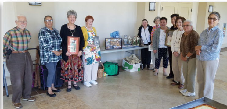
October 19: The Holy Trinity Seniors Fellowship Ministry enjoyed their monthly lunch with a fun addition: some brought memorabilia and crafts and shared stories about them and their lives.