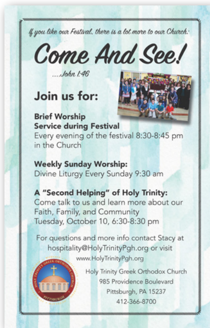
Flyer distributed during Festival

Now, I’m given the impossible task of introducing the Orthodox Church to you in 10 minutes. Exactly.