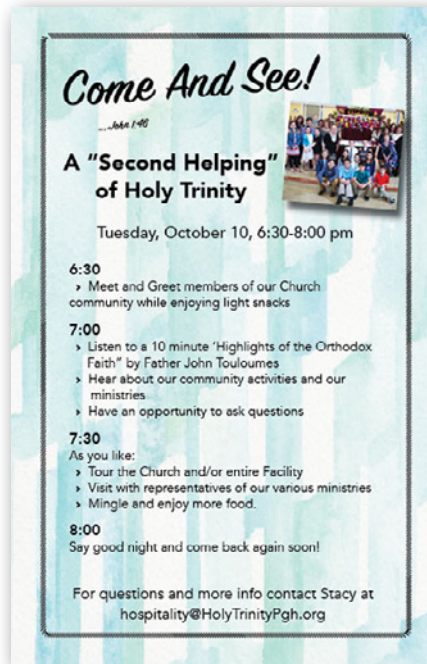
Flyer mailed after Festival