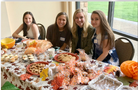
October 15: Holy Trinity GOYAns offer sweets and smiles during their annual Fall Bake Sale, offered this year on Youth Sunday. Others assisted by offering the homilies or assisting the Parish Council.