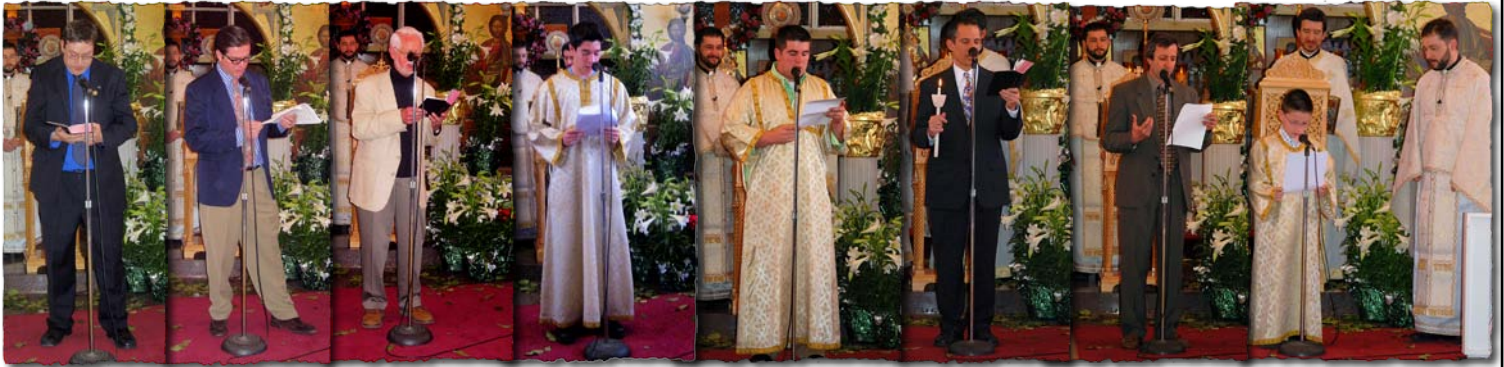
French... Italian... German... Spanish... Chinese... Latin... Modern Greek... & Romanian!