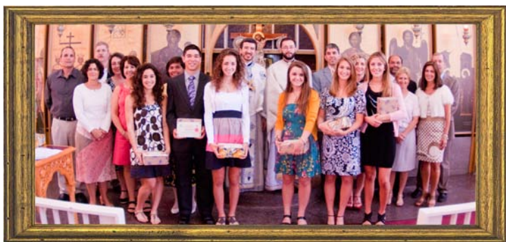
The Holy Trinity Church School 2010 Graduates & Families

Congratulations and May God's Blessings Be With All Our Graduates and Their Families!