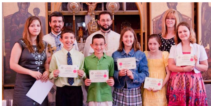
Fifth-Sixth Grade Class