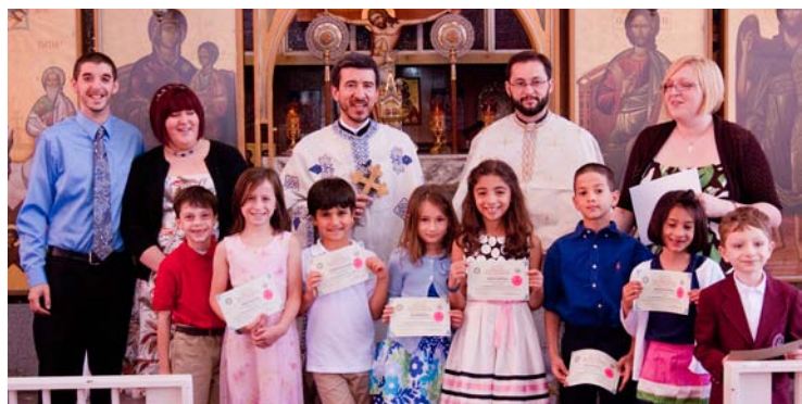
First-Second Grade Class