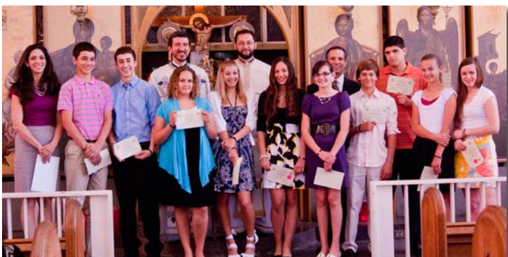
Seventh-Eighth-Ninth Grade Class