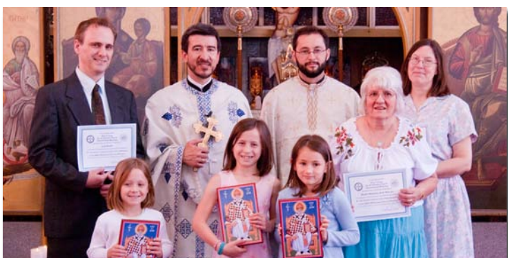
St. Spyridon Children's Lending Library Award