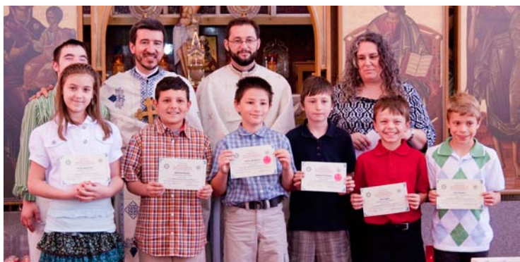
Third-Fourth Grade Class