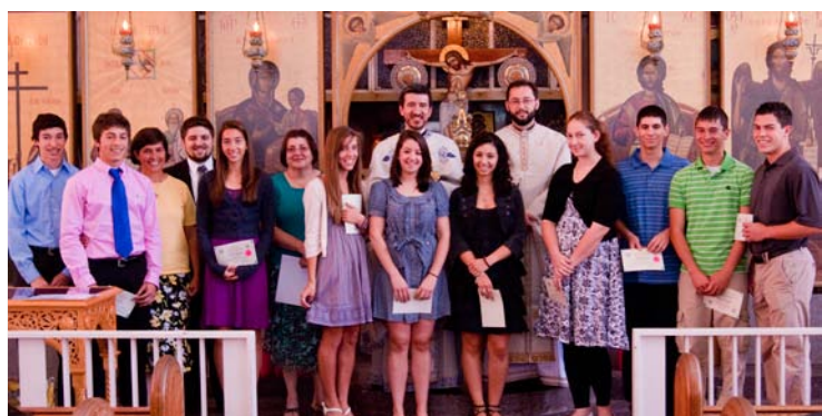
Tenth-Eleventh Grade Class