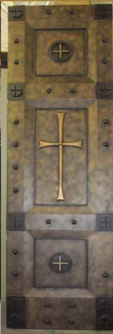
HOLY TRINITY PITTSBURGH 2013 AD