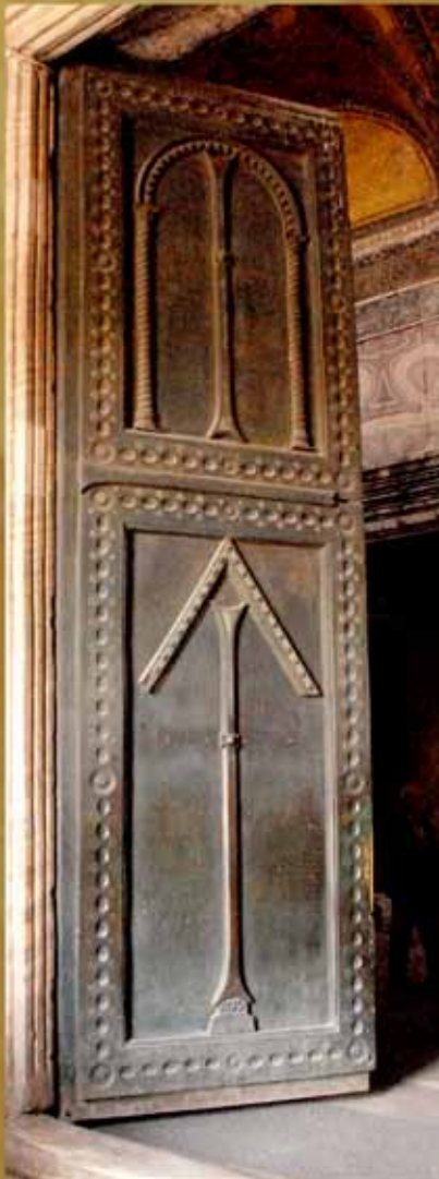
HAGIA SOPHIA CONSTANTINOPLE 537 AD